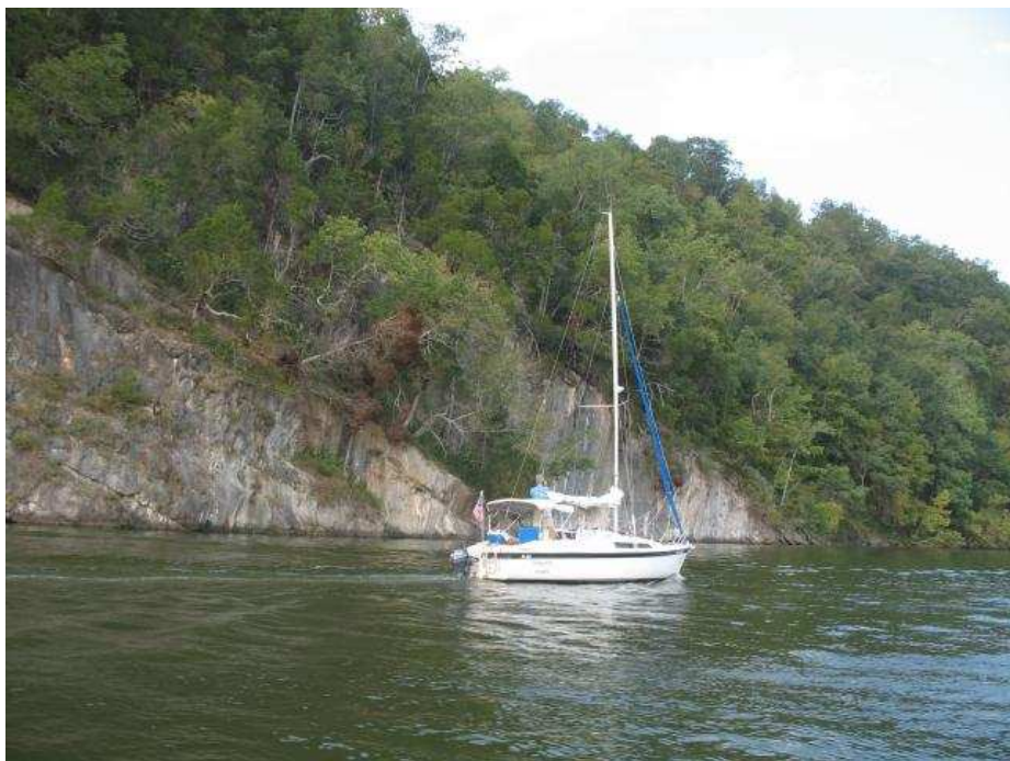
Yes, that's the Tennessee River: